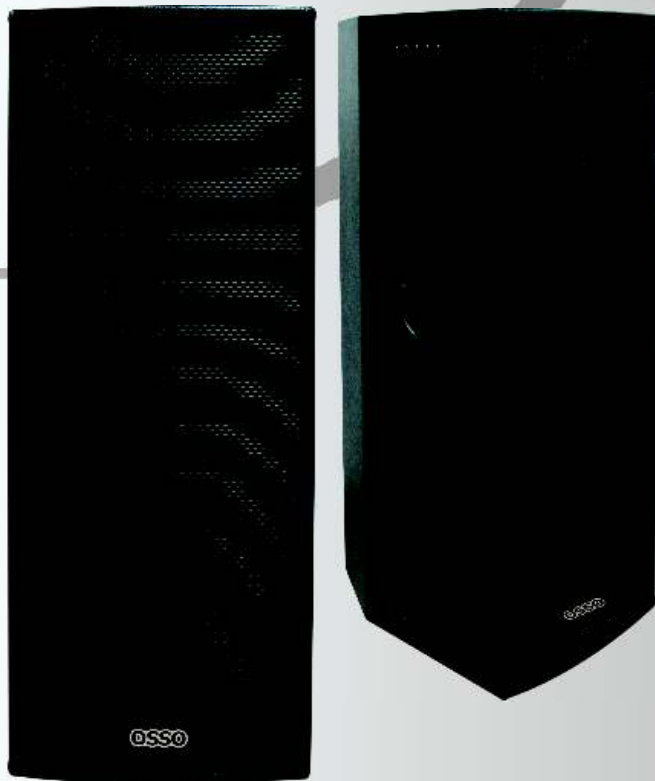
OS 215 H